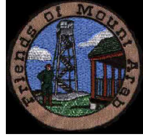
Forest Fire Lookout Association