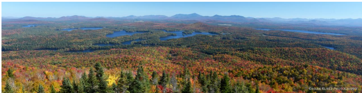
Taken 10/6/2016

On September 29, 2016, the work continued. All debris except the heavy steel roof panels was removed from the summit. Missing nuts and bolts for the wall panels were installed and other hardware used for the window frames and hatch rail that was not correct was replaced. Measurements were taken to possible placement of interpretative panels inside the cab. At the end of the day, remaining paint was brought down off the mountain for warm storage over the winter.