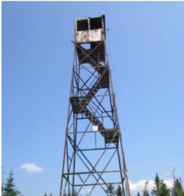
The before picture shows the tower on July 12, 2015