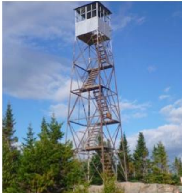
The after picture shows the tower on September 15, 2016

On August 27, September 15, and September 29, 2016 volunteers painted the cab, inside and out, some of the tower frame, and mounting brackets.