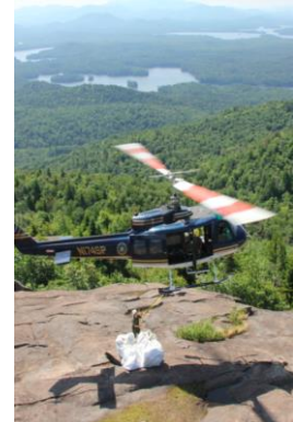
Materials Delivery/Waste Removal